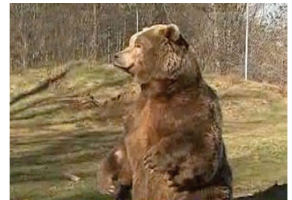
Photo taken by a resident of a bear roaming freely.